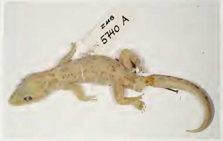
Fig. 10. Hemidactylus angulatus / guineensis complex: lectotype of Hemidactylus guineensis Peters, 1868.

Examination of the lectotype (Figure 10) of H. guineensis Peters, 1868 [described from "Ada Foah, Guinea" (= Adafoa, Ghana; not Adafer, Mauritania, as suggested by Loveridge 1947 and Wermuth 1965!) and compared by Peters (1868) only with H. verruculatus (= H. turcicus )] revealed that despite its provenance from coastal West Africa, it resembles the savannah form rather than the forest form which would strengthen a partial sympatry with the forest-dwelling H. angulatus . However, the distinguishing key character between both forms, i.e. the number of granules bordering the nostril above rostral and first supralabial (Thys van den Audenaerde 1967), has been disproved already by Böhme (1978), and other scalation differences also seem to be insufficient for a clear separation of both forms. Habitus differences could possibly be found in colour pattern, which often seems to consist of